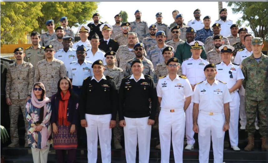
Visit to PNS Bahadur