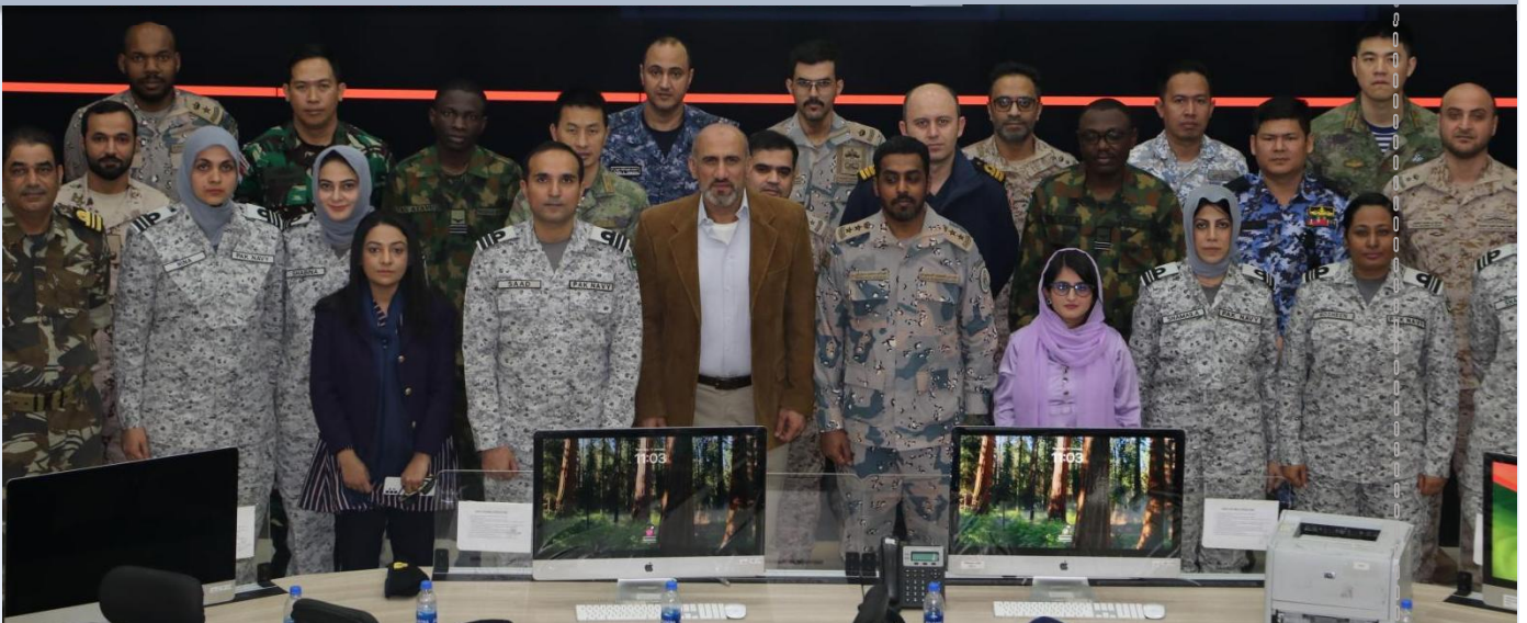
Visit to Joint Maritime Information Coordination Centre (JMICC)