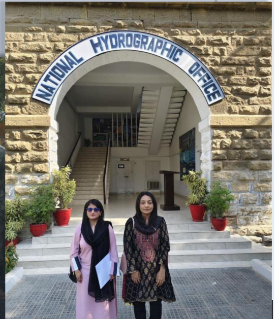
Visit to National Hydrographic Office