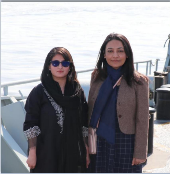
Onboard PNS Aslat